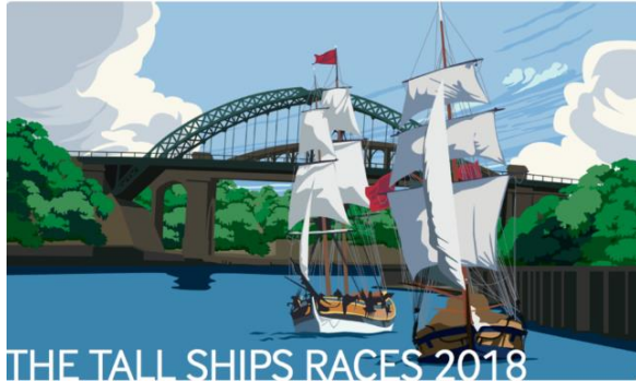
THE TALL SHIPS RACES 2018 Sunderland